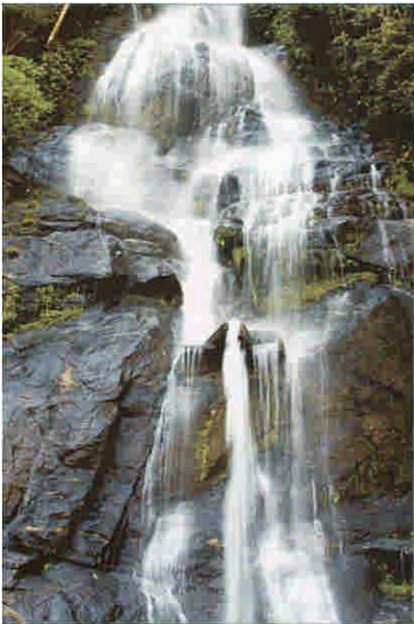
Original Property Photo

The property for sale is located ideally - the water reservoir is totally “self-standing” as it is a sole and “stand-alone” deep water reservoir (under a plate of around 100 to 200 m of granite) and only filled by the rainfalls in the rain forest area. This water is naturally filtered through hundreds of meters of earth and granite formations. Not any contamination is reaching the water before coming from the depth to surface by natural pressure (“ artesian fonts ”).