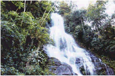
Original Property Photo