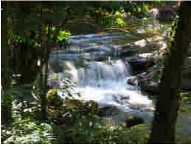
Original Property Photo

All available data has been evaluated by the University of Natural Resources and Applied Life Sciences in Vienna / Austria .