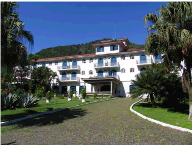
Original Property Photo